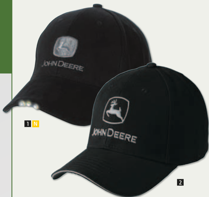
1 LED Cap 6 panel cap with LED lamps on the edge of the peak. John Deere logo embroidered on the front. Supplied with batteries. Adjustable back strap, embossed buckle. Material: 100% heavy brushed cotton. MCJ099399071 2 Safety Cap Black cotton 6 panel cap. All trims are reflective: John Deere and Safety logos. MCJ099378000