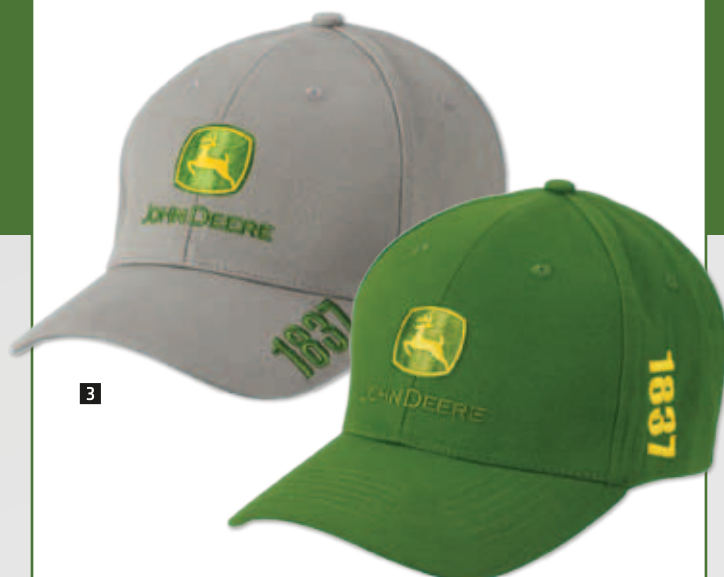
3 Iowa Cap 6 panel cap made of light cotton. Embroidery of the year 1837 and John Deere logo. Adjustable back strap, embossed buckle. MCJ099399062 Grey Green MCJ099399061 4 Flames Cap 6 panel cap. Flames pattern on peak and two coloured logo embroidered on front. Buckle with embossed John Deere logo. Material: 100% brushed cotton. MCJ099399075